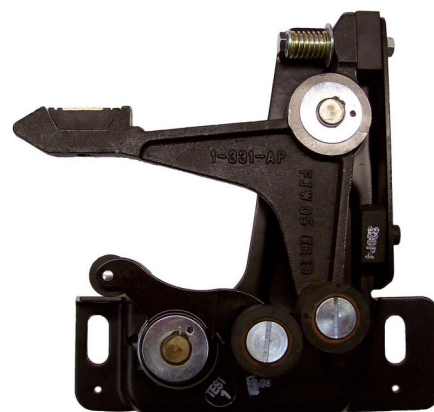
B6940C3 (Right Hand) shown