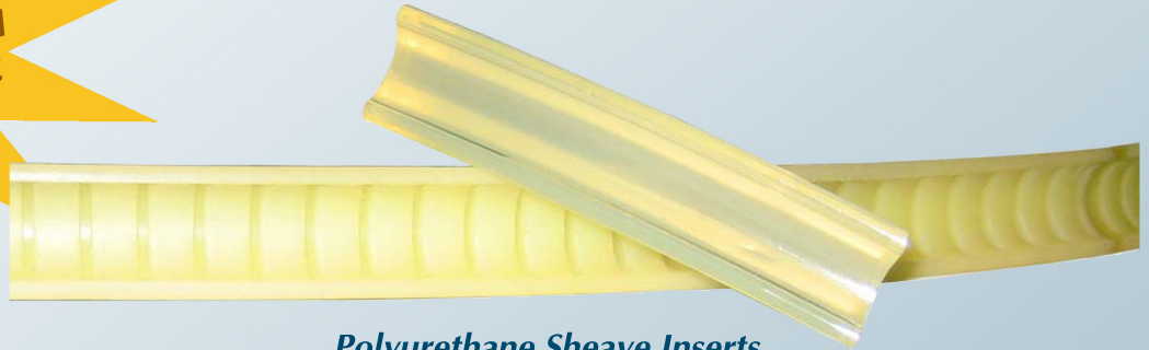
Polyurethane Sheave Inserts

Call Unitec 800-328-7840 For October Special On Sheave Liners!