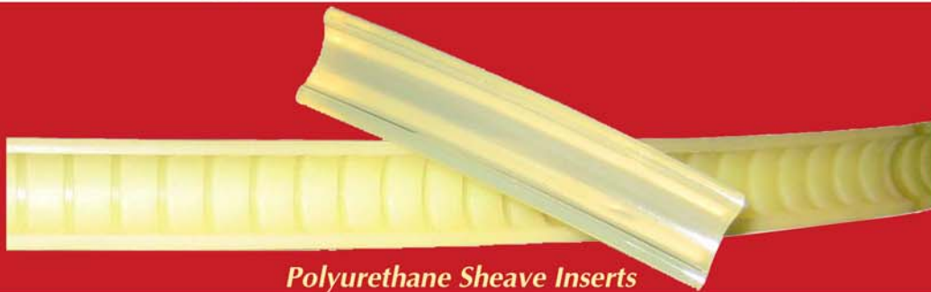
Polyurethane Sheave Inserts

Don't mess with traction concerns! Bring your unit back to OEM spec!